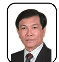
Ismael Tabije Service Projects